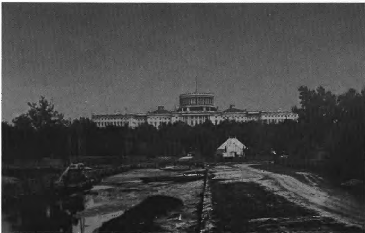
FIGURE 2. — Washington City Canal and U.S. Capitol about 1858.

railroad), and a continuous influx of sewage and garbage, the sediment problem made the canal virtually useless by the early 1850's. For the next 15 years, in spite of a few feeble attempts to rescue it, the canal was allowed to stagnate into an unsightly, smelly, and dangerous open sewer. The Board of Public Works, starting in 1871, began filling in the canal from the Rock Creek Basin to the Anacostia. Except for about the last two blocks, between L and N Streets, South, the city commissioners who assumed city responsibilities from the Board virtually completed the project by 1881 (Tindall, 1914, p. 240; Greene, 1882, p. 2). The Constitution Avenue section actually was partly made into a covered sewer by building a new wall parallel to one of the walls of the canal, arching over the intervening space to form the conduit, and filling in the unneeded channel space outside the sewer. Some of this old sewer is still in use, carrying storm water and air-conditioning cooling water from Federal buildings to the Tidal Basin.