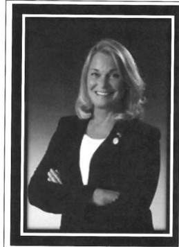
Ann Marie Buerkle

Congressional Delegate to the United Nations