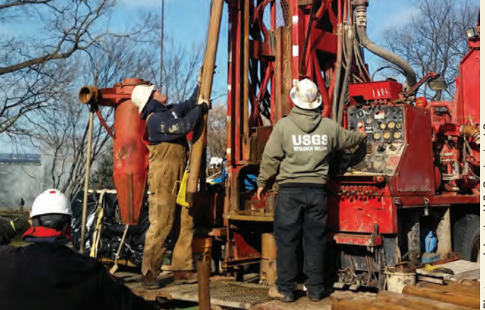
U.S. Geological Survey staff drilling a monitoring well on Long Island, New York.

A groundwater-flow model is a computer model that mathematically calculates how groundwater flows through an aquifer system. The hydrogeologic information from previous investigations will be combined with the information obtained from the new wells and inputted into a three-dimensional groundwater flow model to reproduce (or simulate) current [2019] hydrologic conditions (water levels and flows) and used to predict the most likely outcomes from changes in pumping and sewering and potential changes in the environment, such as sea-level rise and prolonged droughts.