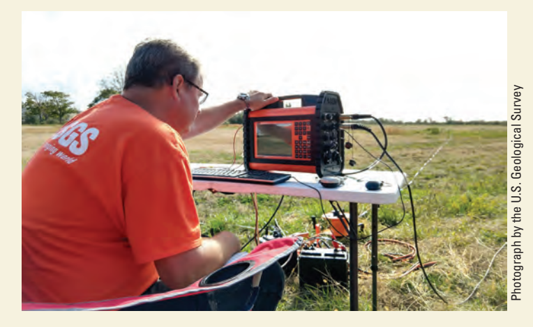
U.S. Geological Survey scientist using surface geophysical equipment to measure electrical conductivity of the subsurface.

Updated hydrogeologic maps are being created by combining existing knowledge with new information collected as part of this study: the USGS has been studying the area's hydrogeology for more than a century. Even though our scientific knowledge of the Long Island aquifer system has increased, there still remain some gaps in our understanding of the complex hydrogeology of this aquifer system. To help fill in these gaps, the USGS is drilling up to 25 new monitoring wells hundreds of feet deep into the