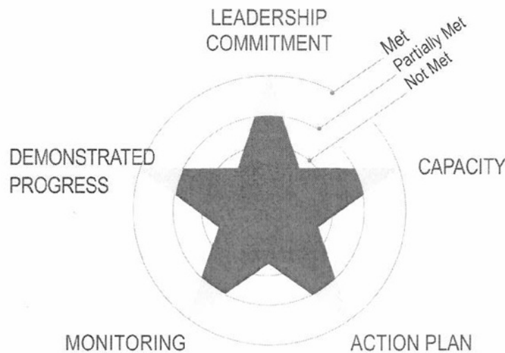
Figure 2: Improving Federal Management of Programs That Serve Tribes and Their Members

As we reported in the March 2019 high-risk report, when we applied the five criteria for High-Risk List removal to each of the three segments—education, energy, and health care—we determined that Indian Affairs, BIE, BIA, and IHS have each demonstrated some progress. Overall, the agencies have partially met the leadership commitment, capacity, action plan, monitoring, and demonstrated progress criteria for the education, health care, and energy areas. However, the agencies continue to face challenges, particularly in retaining permanent leadership and a sufficient workforce.