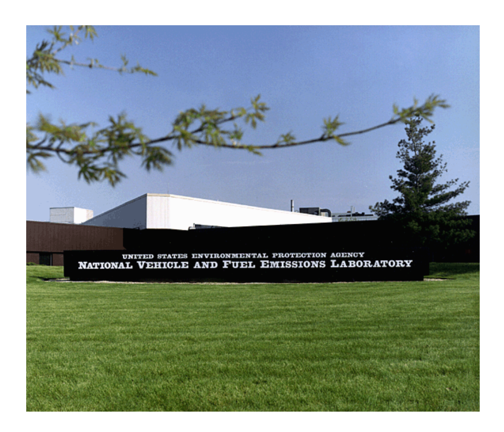
The U.S. Environmental Protection Agency's (EPA) Office of Mobile Sources (OMS) is responsible for carrying out laws to control air pollution from motor vehicles, engines, and their fuels. OMS is divided between EPA's headquarters in Washington, D.C., and the National Vehicle and Fuel Emissions Laboratory (NVFEL) in Ann Arbor, Michigan.