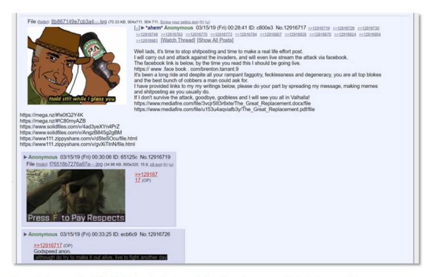
Figure 2: An example of the Christchurch shooter enlisting his online community to help spread his message using 8chan.

A much more pressing issue than the existence of machine learning techniques is the willingness of the worst actors to deploy them. I am often asked why the major tech companies were more successful in eliminating Islamic State content from their platforms versus white supremacists. This is a complicated issue, with multiple factors including the tendency of ISIS members to self-identify, quite visibly and with prominent iconography that machine learning can easily detect, as well as the success of Western law enforcement in infiltrating ISIS support channels and arresting adherents before their planned attacks. A major factor, however, was that very few organizations were willing to intentionally host forums that could serve the need for "community maintenance" for international terrorist organizations. This is a significant departure from the multiple options available to white supremacists, as sites like 8chan happily cultivate them as cherished users.