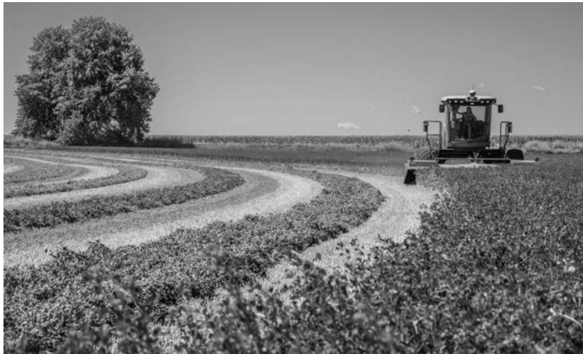
Photograph of a field and a woman driving [a] tractor on the right side.