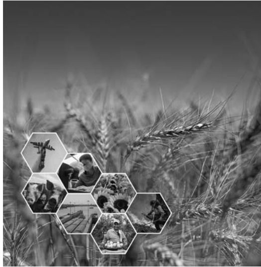
Collage of images in seven hexagon shapes with white borders: fire-fighting airplane, scientist looking into a microscope, two pigs, shipping containers on a river, sunflowers, a firefighter in a forest, and a migrant harvester.

Report 60026-0001-21 October 2019 Office Of Inspector General