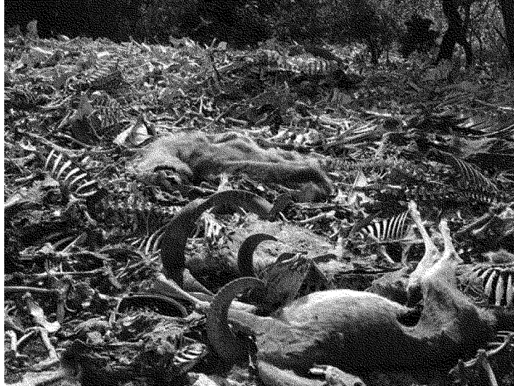
Figure 2. Carcass pile of remains from wild animals that died of anthrax on a ranch in Uvalde, Texas.

Lesson Learned: Being proactive in educating the public can prevent catastrophic animal and human disease.