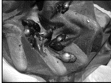
Woodfrog tadpoles infected by ranavirus in Blackiston Wildlife Area in Delaware in 2014. Two days after this photo was taken, all tadpoles were gone; likely died and consumed by other species.

Chytridiomycosis is caused by the fungus Batrachochytrium dendrobatidis ( Bd ). It is widespread now, occurring on every continent that has amphibians and has the potential to affect any species of amphibians. It weakens the skins of amphibians, making it difficult for them to absorb nutrients and take in water, eventually resulting in suffocation. It has resulted in serious declines of over 200 species and the extinction of at least three species in Central America. It has its more deleterious impacts at higher elevations, where it thrives in moist, cool conditions. Some species of frogs, including American bullfrogs, can be reservoirs, passing the disease on to other frogs without becoming sick themselves. It has been implicated in mass die-offs and extinctions of frog species in Central America.