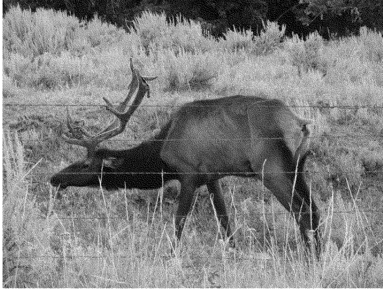
Figure 1. A wild elk with CWD. Notice the extreme emaciation, yet relatively nice antlers. This elk died 15 minutes after this photo was taken. It is rare that animals reach this late stage of CWD in the wild as they are easy prey long before the disease is this pronounced.