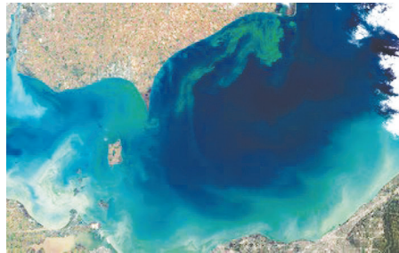
2011 Photo of Lake Erie during Harmful Algal Bloom

In 2014, a massive harmful algal bloom forced Toledo to shut off its water. For days, citizens could not drink, bathe, or cook from the tap. In a modern economy with sophisticated infrastructure, we take ready access to freshwater for granted. But for three days, my region rationed water during this ecological emergency.