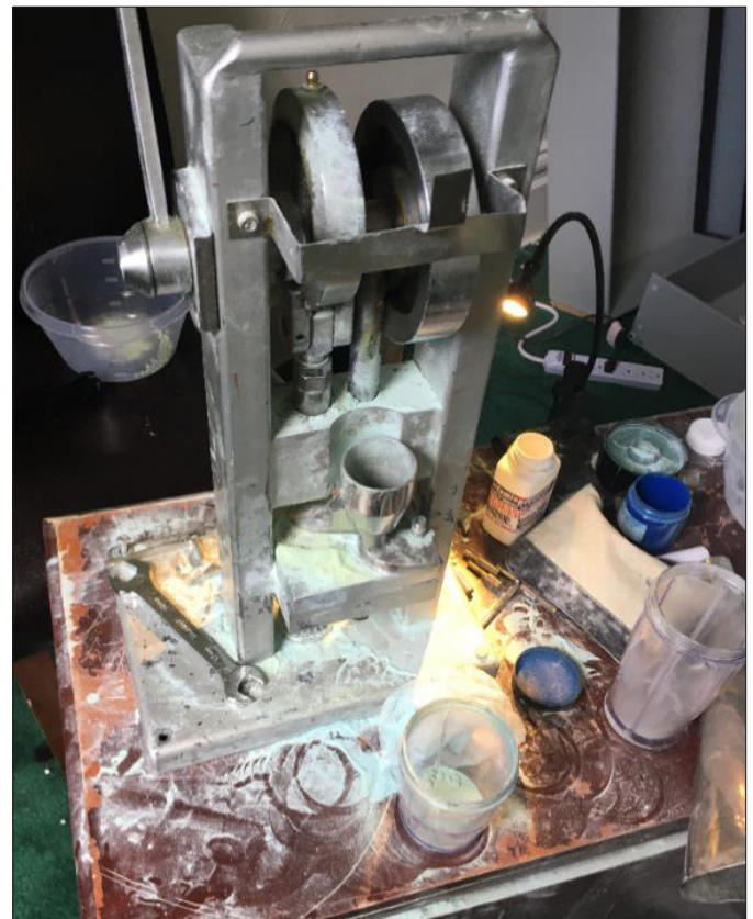
(U) FIGURE 1. SEIZED PILL PRESS, PITTSBURGH, PENNSYLVANIA, 2018

Counterfeit CPDs can be attractive to users who not only face decreased supplies of legitimate CPDs, but also seek a perceived safer form of use to avoid the stigma and health problems associated with injection of illicit opioids. Additionally, counterfeit CPDs can benefit trafficking and distribution organizations seeking access to wider user markets, while significantly increasing profit margins in distribution. Similar to the emergence of fentanyl and FRCs that were marketed and sold as heroin, counterfeit CPDs may continue to proliferate among unsuspecting users who believe they are using oxycodone or hydrocodone. In some instances, production techniques have reportedly improved to where clandestinely manufactured counterfeit CPDs can be virtually indistinguishable from authentic CPDs; therefore, laboratory testing is crucial to determine the true content of tablets appearing as authentic CPDs to mitigate danger as well as help law enforcement authorities to determine appropriate offenses to charge distributors.