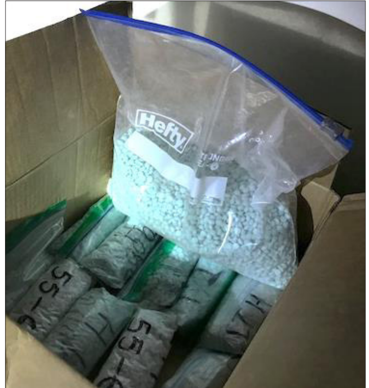
(U) FIGURE 3. SEIZURE OF FENTANYL-LACED COUNTERFEIT CONTROLLED PRESCRIPTION DRUGS, PHILADELPHIA, PENNSYLVANIA, 2018

The local street pricing for Mexican-produced counterfeit CPDs ranges from $15-30 per tablet. When acquired from a source of supply in Mexico, counterfeit CPDs can be purchased for as little as $3 per tablet. The profit potential in selling counterfeit CPDs in the region is substantial (see Figure 4). When coupled with the perception of eluding law enforcement scrutiny, the benefits of distributing counterfeit pills for local DTOs are increasingly attractive.