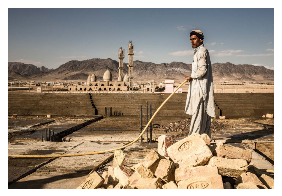
A laborer works on the roof of a large villa under construction in Kandahar, Afghanistan.