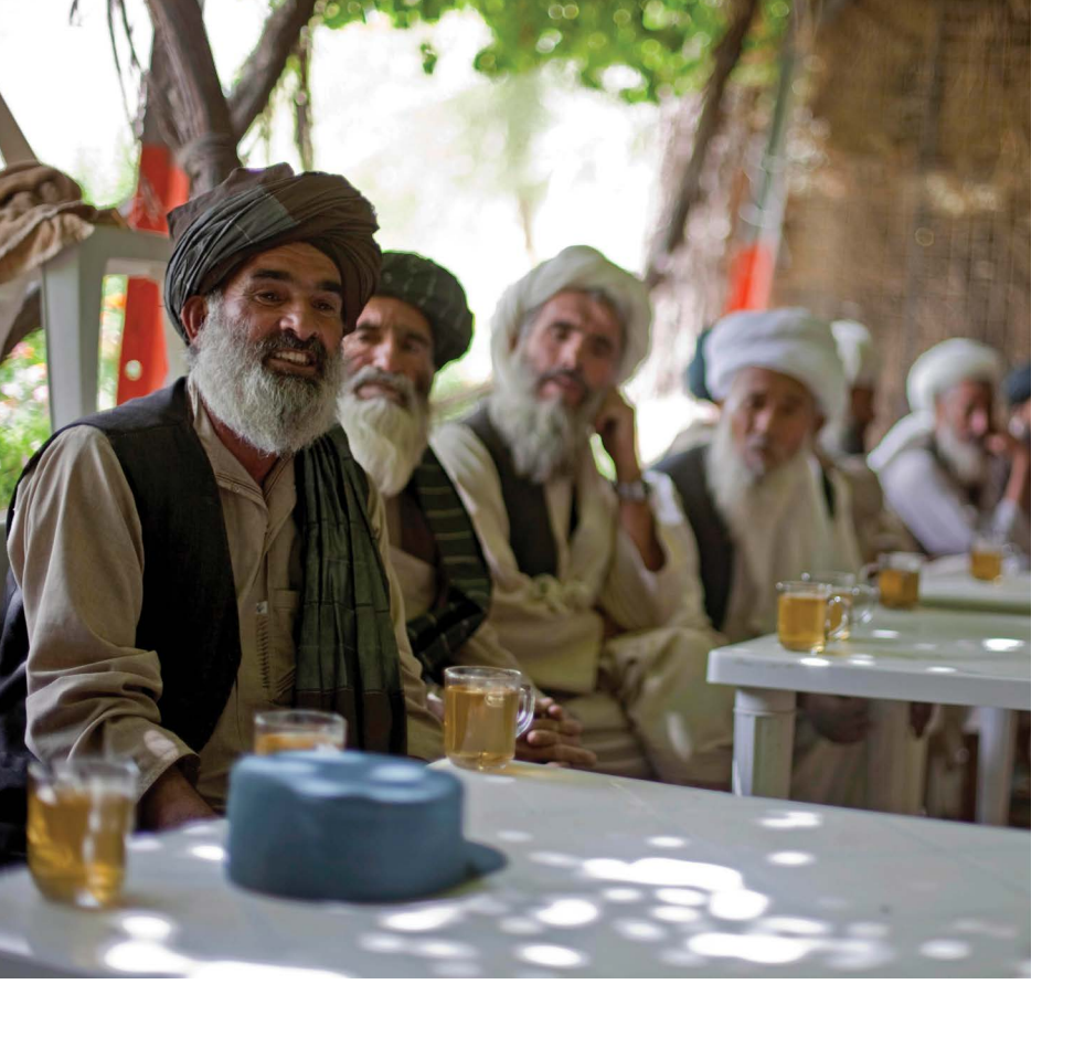
Residents of Helmand's Kajaki district meet with the district governor during a shura session in July 2011.

setting clear conditions for support, particularly on senior staffing; (3) requiring project readiness reviews; (4) being ready to suspend support if patronage and corruption start taking over; and (5) requiring audits. Donors should also refuse to support national programs until the Supreme Audit Office gains at least baseline credibility.