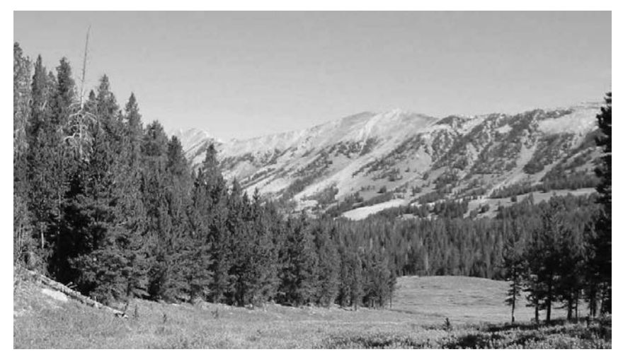
The Custer Gallatin National Forest, Montana.