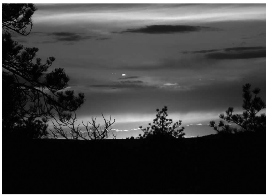
The benefits of healthy forests and rangelands include the protection of environmental values and the promotion of sustainable economic opportunities.

A3D: Incentivize local governments to take voluntary actions to support the creation and expansion of fire-adapted communities and resilience, including the promotion of education, fuels management projects and improved integration of community wildfire protection plans with land use decisions when compatible with local goals. Provide additional analyses to help communities evaluate the full costs of suppression associated with development in the wildland urban interface (WUI).