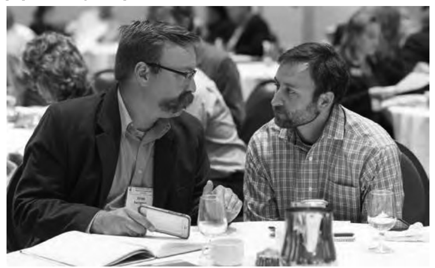
Nearly 400 attendees from across a wide spectrum took part in the regional workshops held in Montana, Idaho, South Dakota and Oregon. Priority 4: Strengthen and expand high impact programs:

L3F: Resolve outstanding issues with potential requirements to reinitiate endangered species consultations following the adoption, amendment or revision of an appropriate management plan.