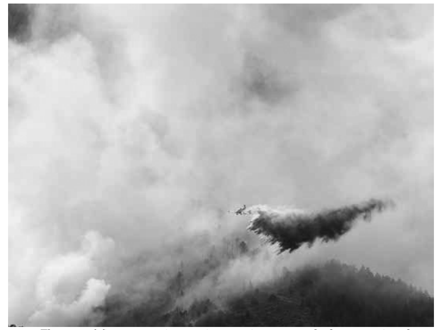
The cost of fire suppression continues to increase, as budgets remain relatively flat, which results in the need to transfer funds from non-fire to fire accounts when budgeted funds are insufficient.

L1B: Address the associated impacts of wildfire funding on Federal natural resource management capacity, planning and project implementation. Ensure budget actions continue to support state wildfire and forestry capacity, including the USFS State and Private Forestry programs.