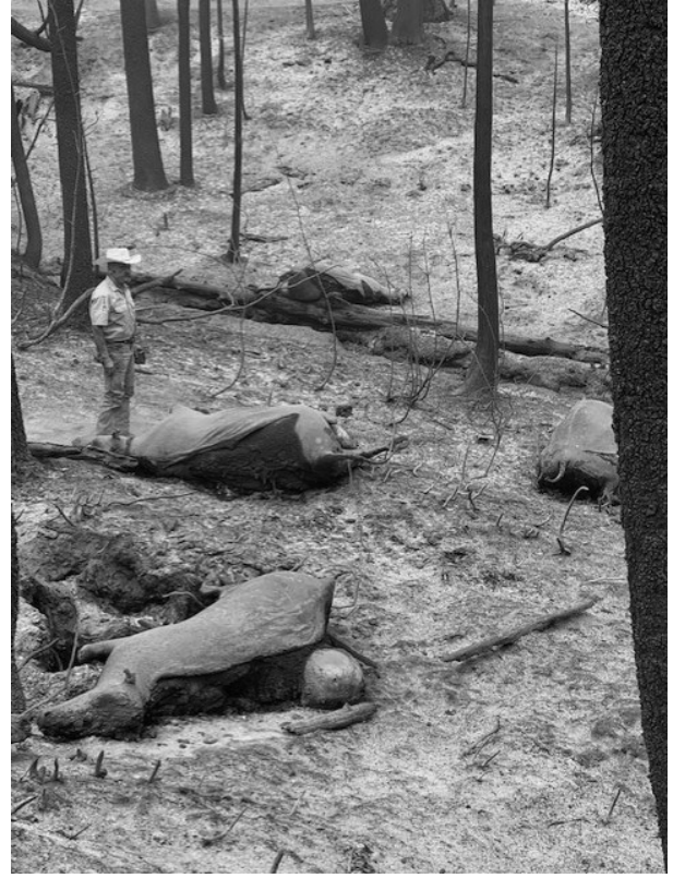
Rancher observing damage to land, cattle and legacy, post fire.