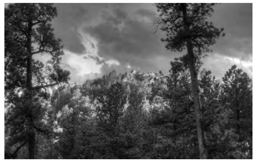
Black Hills Forest, South Dakota.

South Dakota's effort to address Mountain Pine Beetle (MPB) infestation is an excellent example of successful cross-boundary management: