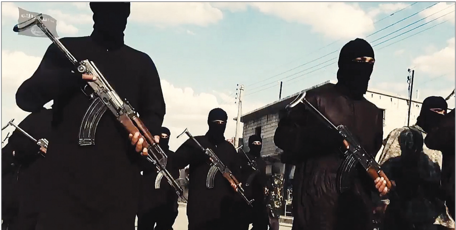
A still image from a May 19, 2015, Islamic State video of militants marching in Raqqa, Syria.