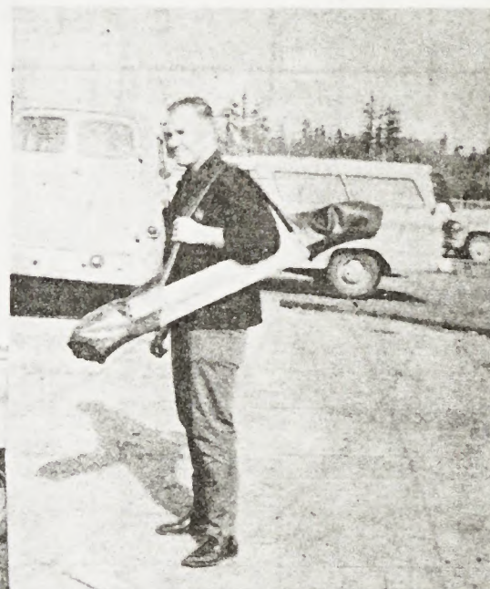
CARRYING LONG STAKES