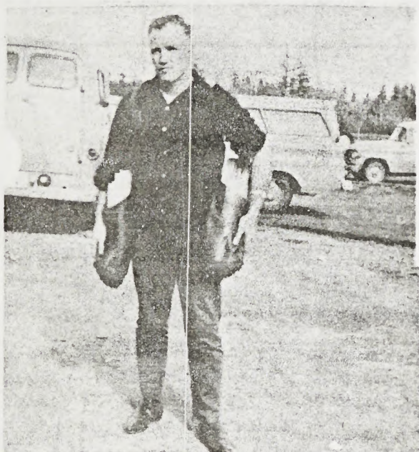
CARRYING SHORT STAKES

The pack is also quite useful for carrying paint cans and other field equipment.