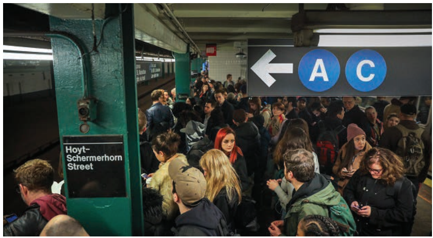
A crowded subway stop in Manhattan

The workers who toil on New York City's subways and buses are disproportion-