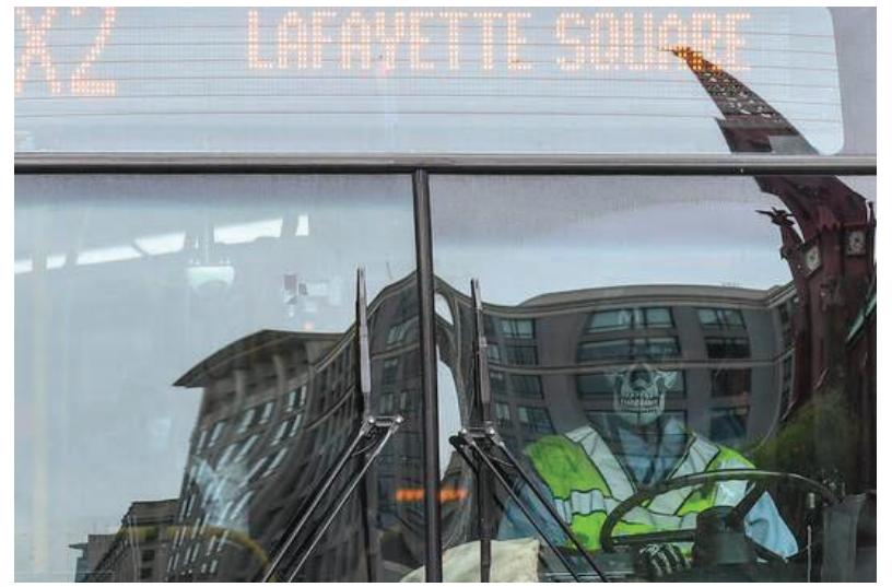
A Metrobus operator drives through Chinatown in Washington on May 5.