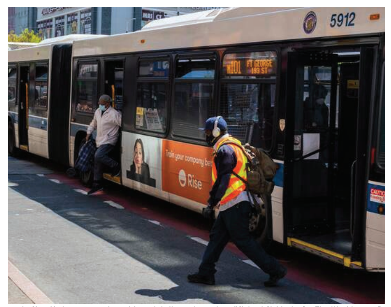
Buses in New York are operating with social distancing rules.