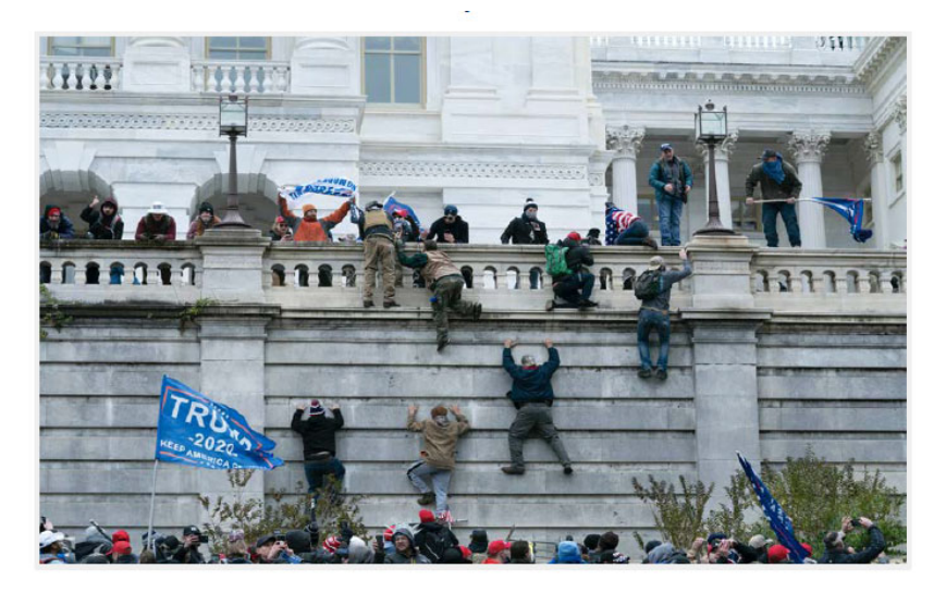
THE ARMED INSURRECTION AT THE U.S. CAPITOL

In September 2020, Everytown released a comprehensive report detailing these threats entitled "Armed and Dangerous: How the Gun Lobby Enshrines Guns as Tools of the Extreme Right." This report, which builds on the findings of our prior research, reviews (i) the presence of firearms at the Capitol insurrection, (ii) the constellation of extreme right actors present at the Capitol, (iii) these same groups' presence at armed protests throughout 2020, (iv) the gun lobby's complicity in the rise of extremism, and (v) policy solutions for disrupting how extremists use firearms to undercut democracy.