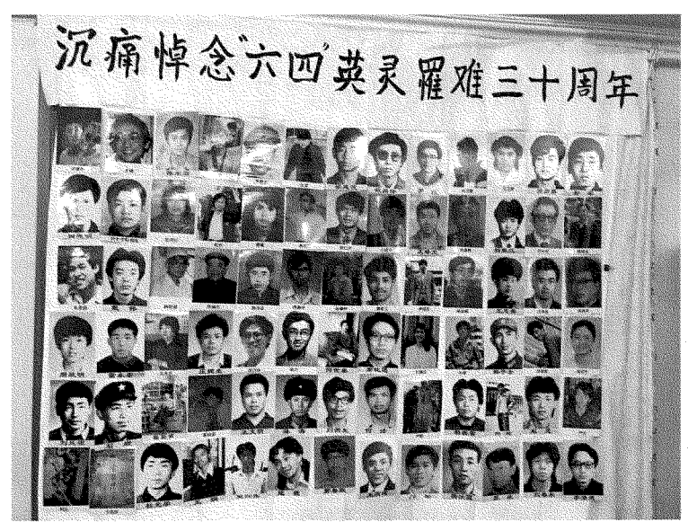
Thirtieth anniversary commemorative shrine honoring those killed in June Fourth.

and the murderers be held accountable. Over the last 30 years, we have never given up, never stopped searching for those who share our fates, and never surrendered to our tragic lot. Through our mutual support and assistance, we built consensus in our difficult journey, and came together to form the Tiananmen Mothers. This unique community of sufferers, whose fates are bonded by June Fourth, has been steadfastly guarding your spirits in the storm.