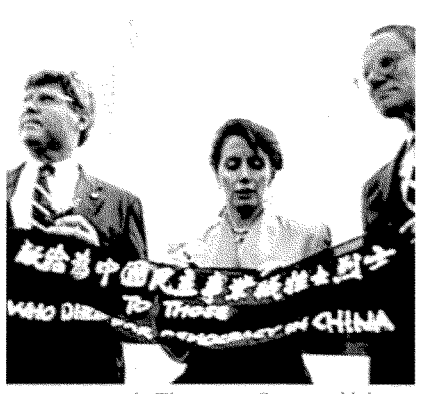
Nancy Pelosi as U.S. Congresswoman in Tiananmen Square with banner: "To Those Who Died for Democracy in China," September 1991. Source.

As early as 1991, two years following your martyrdom, Nancy Pelosi, then U.S. Congresswoman and now Speaker of the House of Representatives, came to China. Under the glare of armed police standing guard in the streets, Pelosi courageously came to Tiananmen Square—where you had fallen—to unfurl a banner that reads, "To Those Who Died for Democracy in China."