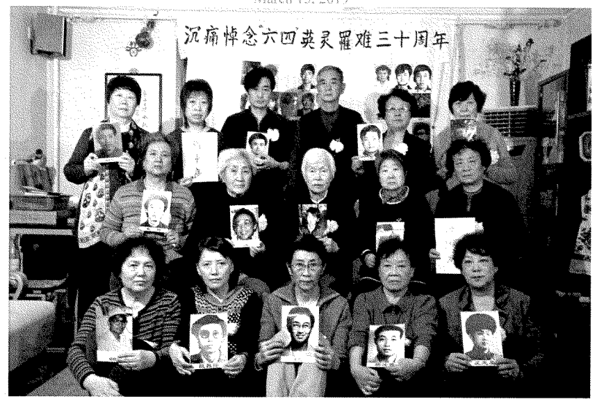
Members of the Tiananmen Mothers with photos of their loved ones killed in June Fourth.

[English Translation by Human Rights in China]