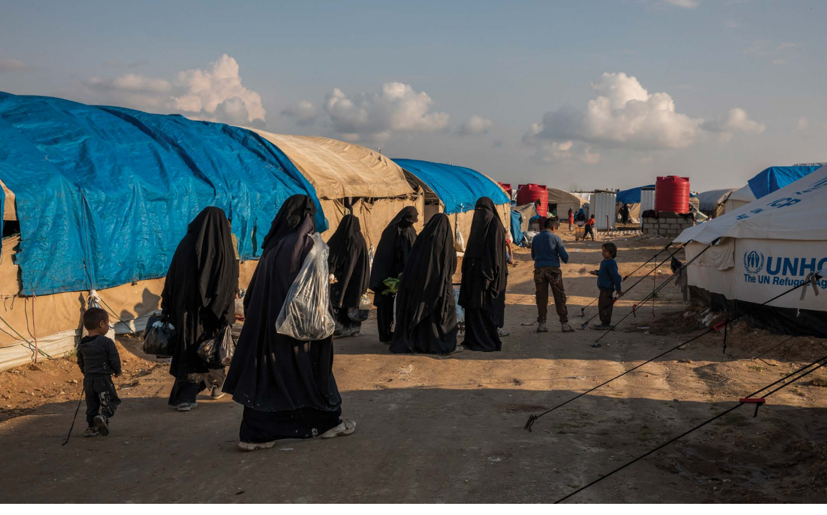
Women and children walk between tents at the al-Hol detention camp in Kurdish-controlled northern Syria on March 28, 2019.