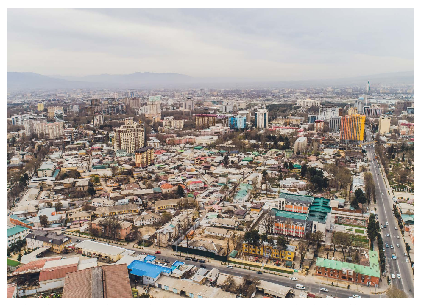
Dushanbe, the capital city of Tajikistan, pictured on June 12, 2018. Since gaining independence with the dissolution of the Soviet Union in 1991, the Central Asia republics have been challenged by the threat of violent extremism.

returning foreign terrorist fighters," a point underscored by the EU's Counter Terrorism Centre.<sup>2</sup> Yet Resolution 2178 leaves the means and the timeline of repatriation up to individual countries, which differ widely in their approach. Despite repeated calls by the UN for countries to take back their citizens who traveled to or are being held in Syria and Iraq, only a small number of countries have actively taken steps to organize returns. Indeed, some countries have revoked citizenship, potentially in violation of the 1961 Convention on the Reduction of Statelessness, further limiting the possibility of return and hindering the ability to provide justice.<sup>3</sup>