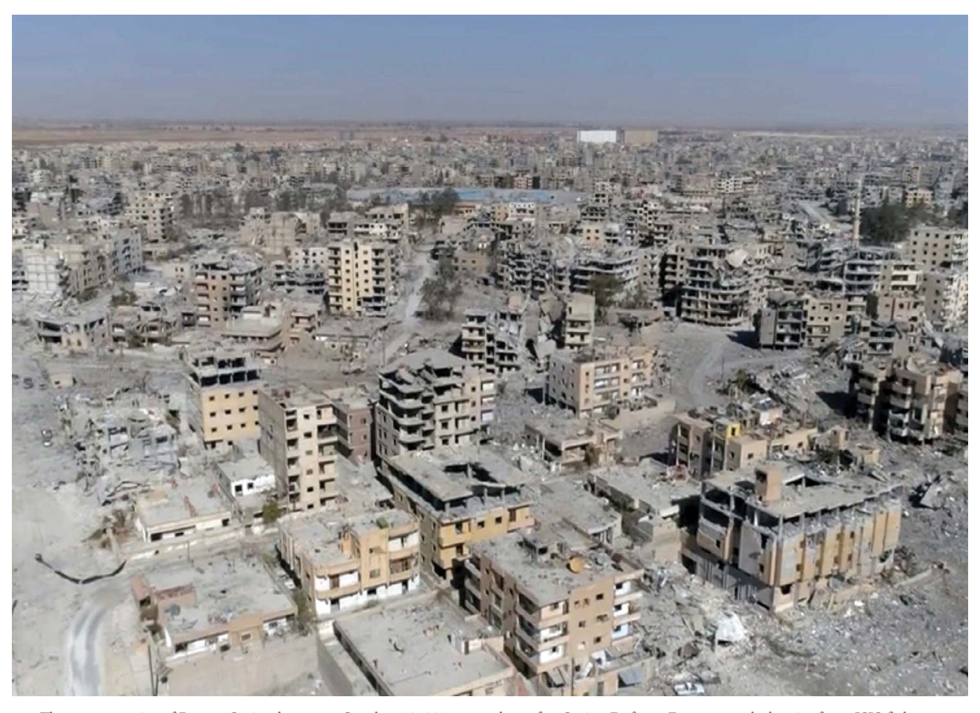
The war-torn city of Raqqa, Syria, shown on October 19, 2017, two days after Syrian Defense Forces retook the city from ISIS fighters, including many of Central Asia origin.

of Uzbekistan.<sup>40</sup> All returnees were placed in a special camp, passed a medical examination, and received treatment. The psychologists who worked with returnees tried to relieve mental tension in the women and children. Through a process of restored identity, all adult returnees received new identification documents, and children received state birth certificates. The entire rehabilitation process lasted approximately one month.