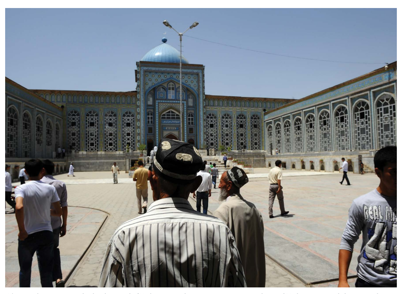
The central mosque in Dushanbe, the capital of Tajikistan, on July 1, 2011. As many as two thousand Tajik citizens traveled to Iraq and Syria to live and fight with ISIS.

Though there was no specific returnee scenario planned from the onset of the conflict in Syria and Iraq, the leadership of Tajikistan early expressed political will regarding the return and amnesty of those willing to renounce their past actions. Unlike Uzbekistan and Kazakhstan, Tajikistan decided to count those who returned on their own among the legitimate repatriates, rather than limiting the definition only to persons who returned under the auspices of the state. Since 2015, Tajikistan has made available an automatic amnesty option for individuals who voluntarily return and report to authorities. In accordance with this amnesty law, 111 people were amnestied in April 2018, and in September 2019 their number exceeded 200. Of these, only two have returned to the war zone to date, with the remainder continuing to live and work peacefully at home or in migration, ostensible evidence of their successful rehabilitation. However, unlike the returned children, there have been no established rehabilitation and support programs for returned and amnestied adults or for convicted violent extremists released from prison.