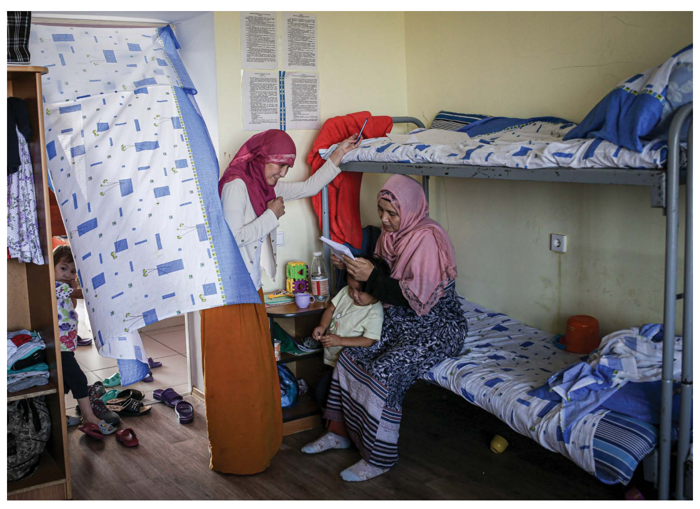
Women who formerly lived under the Islamic State at a rehabilitation center in Aktau, Kazakhstan, in July 2019.

leisure time activities, such as visits to museums and exhibitions, and familiarization with the history and culture of Kazakhstan.