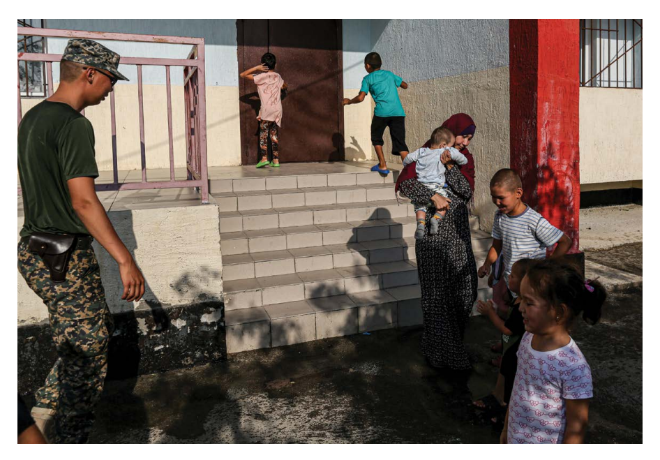
Women and children at a rehabilitation center for women repatriated from the Islamic State, in Aktau, Kazakhstan, on July 22, 2019.