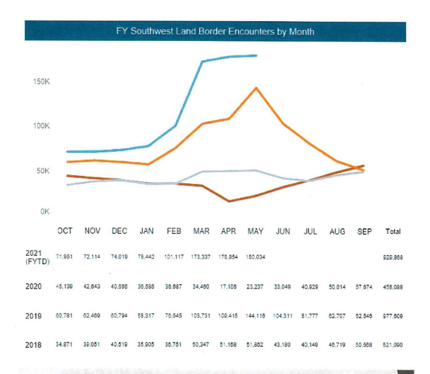
CHARTS SUBMITTED BY HON. DAN BISHOP