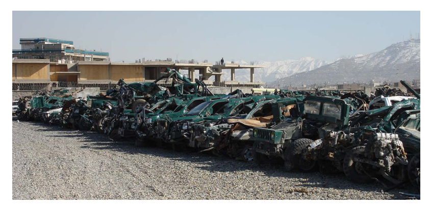
Kabul-based Afghan National Police vehicles damaged beyond repair in only one month