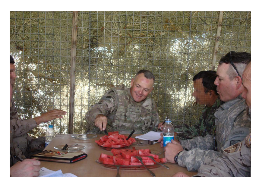
{\it Shura}, or meeting, between senior {\it NTM-A personnel} \ and \ Afghan \ Army \ officers, northwestern \ Afghanistan