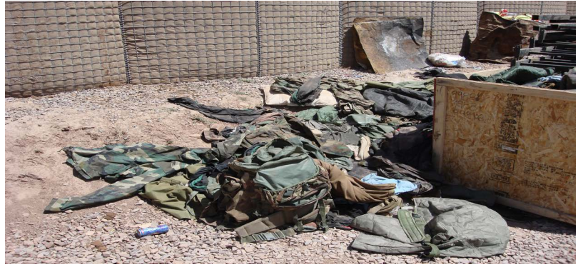
Afghan soldiers in many forward bases would simply discard NTM-A-supplied gear that they felt was unnecessary.