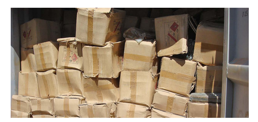
Shipping containers on an Afghan Army base filled with aging sticks of TNT