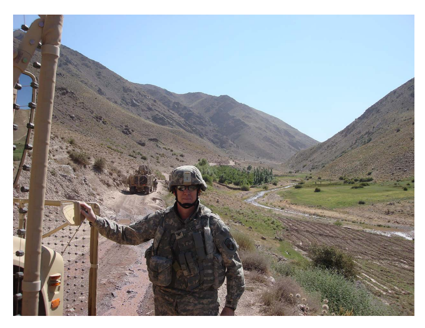
Highway 1 in northwestern Afghanistan