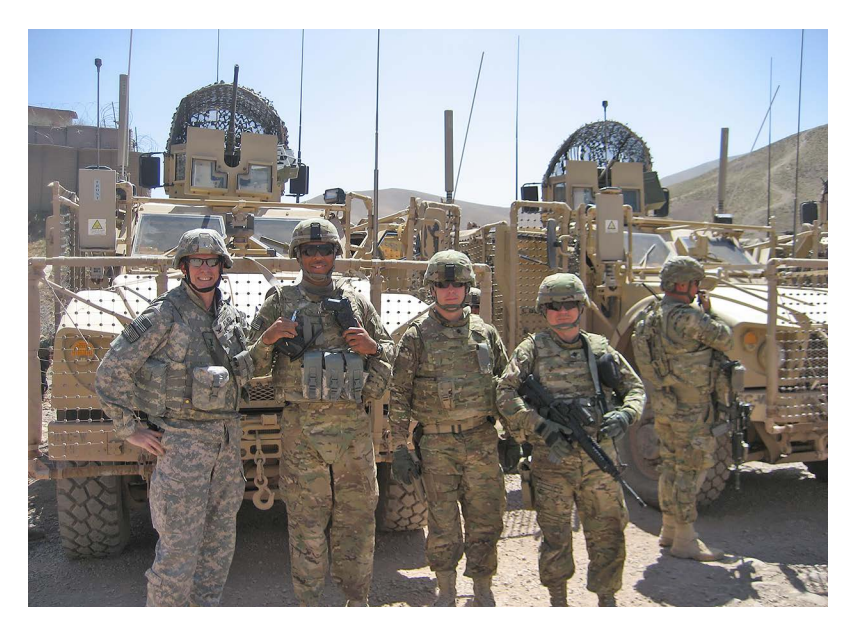
NTM-A personnel outside the wire