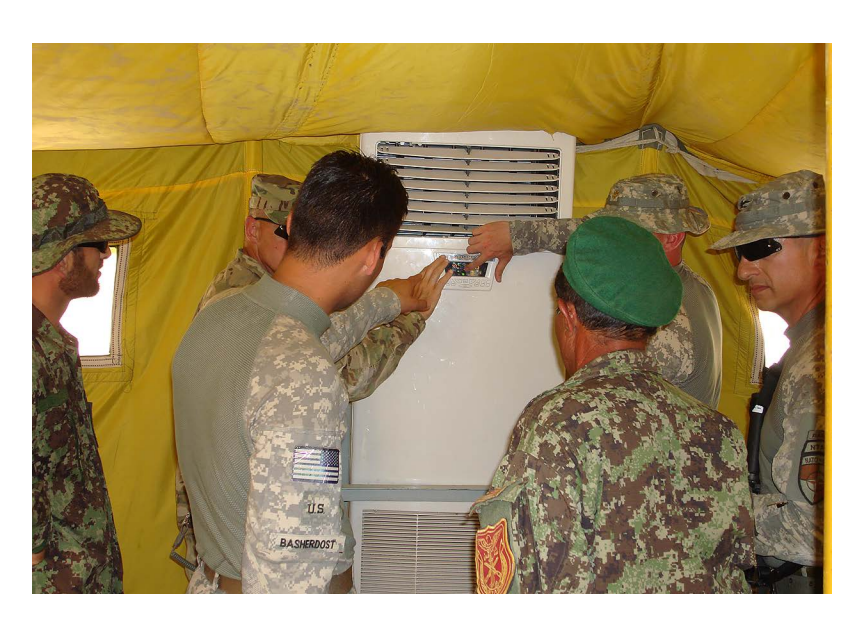
The limits of modernity. Afghan and NTM-A officers troubleshooting a broken air conditioner in a troop tent.