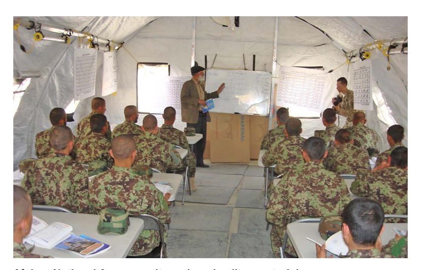
Afghan National Army recruits undergoing literacy training

Some photos modified by Air University Press to preserve anonymity