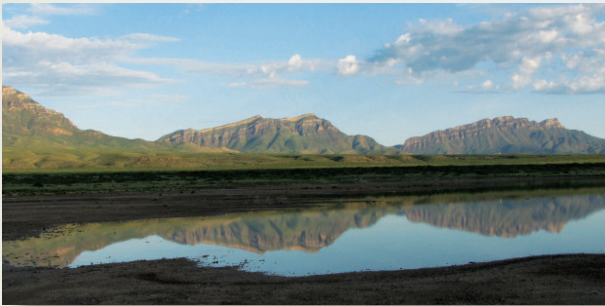
Lake Lucero is a remnant of ancient Lake Otero. The same processes that formed crystals in Lake Otero continue today in this playa.

Today, rainfall in the mountains still flows down the sides of the Tularosa Basin. Water dissolves gypsum in rocks as it travels and settles in low areas of the basin. Much of it settles in Alkali Flat and Lake Lucero. These areas are ephemeral lakes, or playas, that fill with water only parts of the year. On the surface of these playas, the final steps in the formation of rare gypsum sand can still be seen today as the water evaporates.