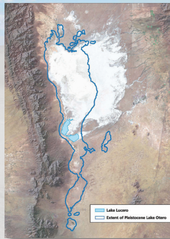
Lake Otero once covered much of the Tularosa Basin. When it dried, gypsum deposits were left behind on the basin floor.

Two to three million years ago the ancient Rio Grande flowed along the southern edge of the Tularosa Basin. Sand deposits from the river blocked-off the southern edge of the basin, preventing snowmelt and rainfall from flowing out of it. This allowed for the formation of the 1,600 square-mile Lake Otero.