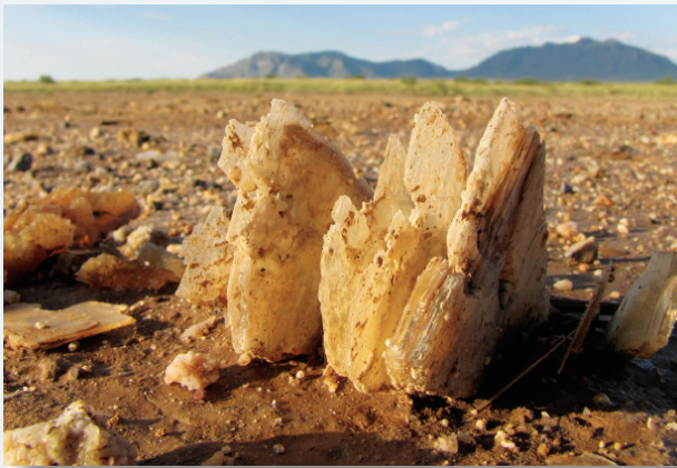
Selenite crystals on the surface of Lake Lucero

Each year some of the crystals emerge from the protective mud surface of Lake Lucero as wind and rain remove sediments from around them. Once exposed, crystals begin the gradual process of erosion into smaller and smaller pieces.