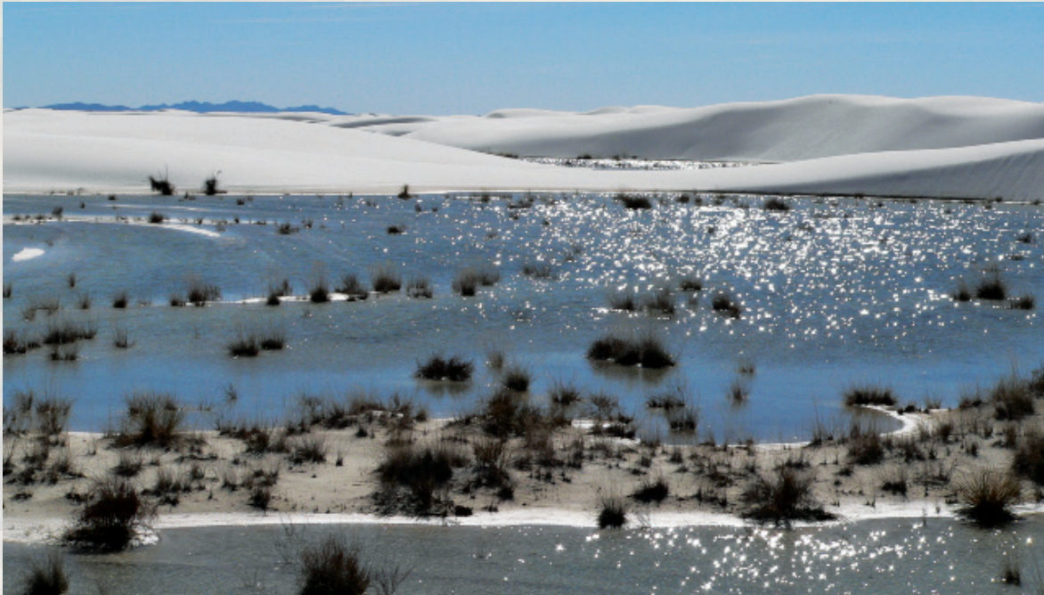
Heavy rain in 2006 flooded interdunal areas throughout the park. Normally, White Sands has a perched water table that lies one to two feet below the surface of interdunal flats. During this storm, the unusually heavy rainfall raised the water table to the surface, which resulted in extensive flooding in the dunefield for six months.

Because of the consistent wind, dunes are ever-shifting. Some dunes in the heart of the dunefield can travel twelve to thirteen feet per year, keeping anything but the occasional grasses from taking root. Others, on the edges of the dunefield, move only inches to a few feet per year and are firmly held in place by a variety of desert plants and soil crust.