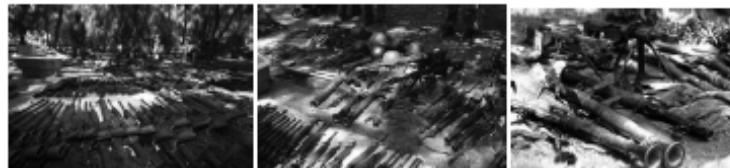
Figure 3-Hundreds of weapons seized at a Zeta Cartel training camp in Higuera, NL, Mexico, about 80 miles southwest of the Texas border.