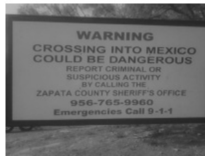
Figure 7 – A sign warning U. S. fishermen to stay away from Mexican waters in Falcon Lake, in Zapata County, Texas. It also reads to report suspicious activity to the Zapata County Sheriff's Office.