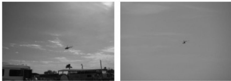
Figure 8 - Photographs of two incidents involving incursions of Mexican military helicopters into Zapata and Starr Counties.