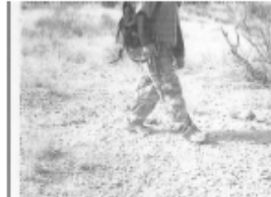
Figure 1-Armed individuals escorting either narcotics or illegal aliens into the U. S. Traffickers are now made responsible for their "loads" and are being instructed to "shoot it out" with law enforcement if there is a possibility they will be apprehended. In the photograph on the right, the one person leading is the one carrying the longarm.