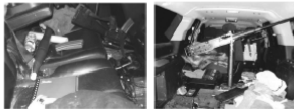
Figure 2-Rocket Propelled Grenade and .50 Cal. Machine gun found in Nuevo Laredo, Mexico, in mid-February 2010. The firefights in Mexico are just yards away from the United States.