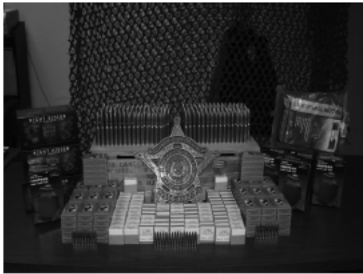
Figure 4 - Ammunition, including .50 cal. bullets, camouflage netting, and night vision equipment seized by Zapata County Sheriff's Deputies.