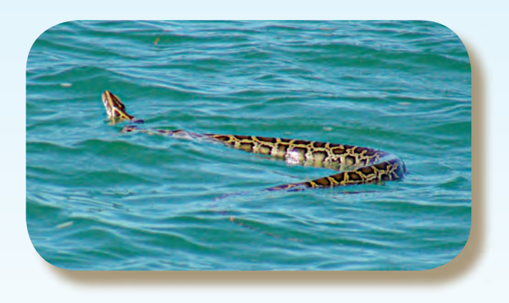
Burmese python swimming in Florida Bay, Camp Walker, Islamorada, Fla.