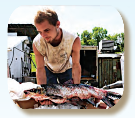
Young wild-caught black carp taken by commercial fishers in the Red-Atchafalaya River system

An improved understanding of genetic population dynamics can also be used to determine whether separate populations of non-native species exist in the wild. This determination can help managers target the main breeding population of invasive species for control or removal efforts.