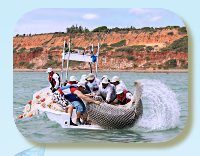
Manatees are netted and brought into a boat for health assessments and tracking studies in Brazil

• Trending Techniques—Understanding trends in survival is crucial for estimating overall mortality and recruitment rates in manatee populations. A new Florida manatee modeling approach based on mark-recapture methods is being designed to jointly analyze photo-identification and genetic data. Unlike visually-based documentation, genetic data does not require marks on a manatee's body to follow its life history. For the first time, unscarred individuals, unaffected by encounters with boats, can be factored into the analysis of population trends. This will lead to more encompassing survival estimates and better assessment of the population size and extinction risk.