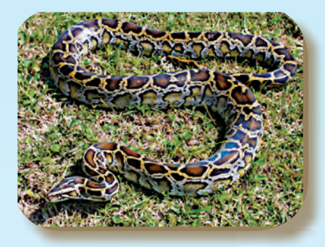
Invasive Burmese python in Everglades National Park

unintentional escapes, and gauge the likelihood of the population increasing and becoming established in the ecosystem. Genetic examination of gut contents can determine the native species that are preyed upon by invasive species, which helps managers assess the impact of invasives on the environment and imperiled species.