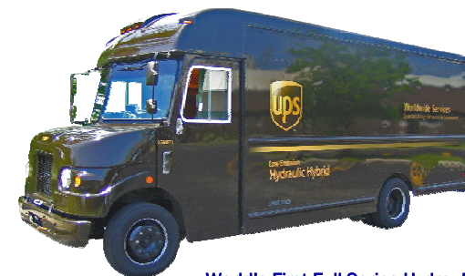
World's First Full Series Hydraulic Hybrid Delivery Vehicle Prototyped in a UPS "Package Car"