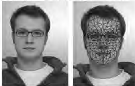
Illustrations of the areas used by a face recognition algorithm

Face recognition is not a new concept—police officers have been using face recognition for as long as there have been criminals. However, now the algorithms for face recognition have progressed to the point where software is much better at matching faces than the average humans is.