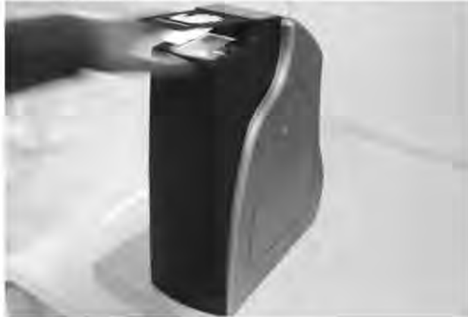
Morpho Finger-on-the-Fly contactless fingerprint reader

Speaking to our device, it captures four finger images with a single movement of the hand in less than a second. Its fast acquisition capability allows subjects to provide fingerprints while on the move, which makes it suited for high-traffic environments. This method of fingerprint capture also alleviates hygienic concerns when using a commonly touched surface.