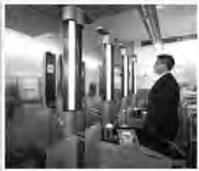
MorphoWay™ eGates read biometric information contained in travel documents and compare it with the document holder's biometric data.

Other major deployments include fingerprint based systems in France and Indonesia, iris recognition systems in the United Kingdom and the United Arab Emirates, and face recognition systems in Germany and the Czech Republic. Many of these systems are not limited to ePassport holders of the host country. Of the systems mentioned, holders of second generation U.S. ePassports are able to use the Australia and New Zealand's SmartGate and the French Parafe, and the systems in France, the United Kingdom, Germany and the Czech Republic are open to all second generation ePassport holders of the European Union.