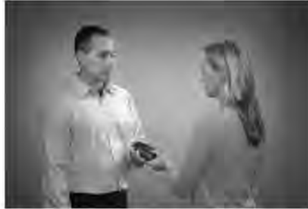
AOptix Stratus™ mobile identity solution

Speaking of iPhones- everyone can see how the cost and size of cameras has also declined. My iPhone 5 has an 8 megapixel camera, and the new ones even have autofocus. Nokia now has a 41 megapixel camera. When the study was done in 2008 you could not buy a 41 megapixel camera at any price. This remarkable change has allowed cameras to be ubiquitous, and has facilitated law enforcement activities using face recognition.