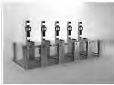
MorphoWay™ fully automated eGates

Other major deployments include fingerprint based systems in France and Indonesia, iris recognition systems in the United Kingdom and the United Arab Emirates, and face recognition systems in Germany and the Czech Republic. Many of these systems are not limited to ePassport holders of the host country. Of the systems mentioned, holders of second generation U.S. ePassports are able to use the Australia and New Zealand's SmartGate and the French Parafe, and the systems in France, the United Kingdom, Germany and the Czech Republic are open to all second generation ePassport holders of the European Union.