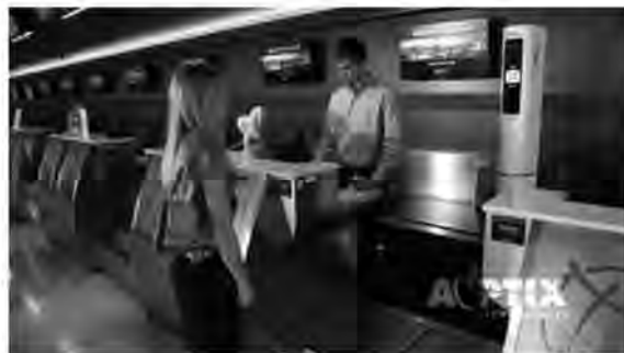
AOptix Insight ® dual face and iris capture at check-in

Today's dual face and iris cameras are of sufficiently high resolution that a photograph taken, with the appropriate lens and lighting, from the distance shown in the photograph below, still has the resolution necessary to perform accurate matches. With faster computer systems and advances in computer vision algorithms, these systems will just keep getting better.