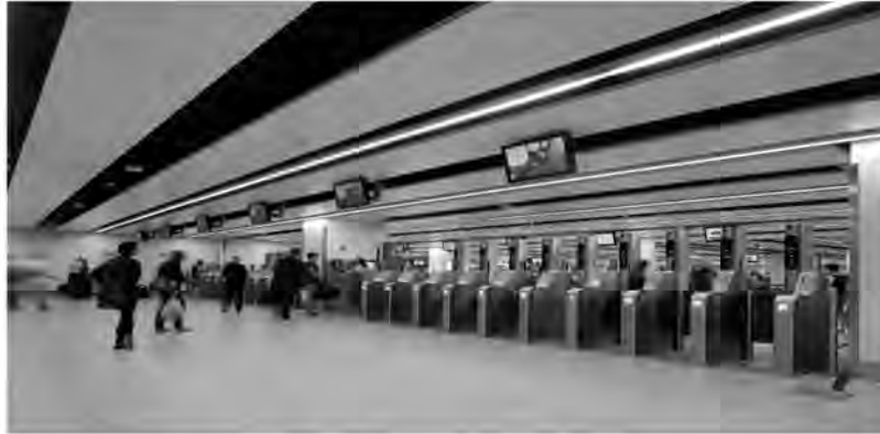
Gatwick Airport, London UK

Over 25 lanes of AOptix InSight Iris Recognition are deployed at Gatwick in what is called a "mixed use departure area"-- where international and domestic-destined passengers utilize the same retail and restaurant amenities. Passenger mixing that without proper safeguards, might yield boarding pass swapping and an "Immigration Bypass" has been negated by use of an iris system that requires iris template-barcode linkage on boarding passes for domestically-enrolled passengers (no iris enrollment on the sterile side of the border). Operation of the technology is simple: instruction for self-enrollment is delivered via exposure to 2 exposures to picture-only LCD's on the domestic side. The process is simple enough that even a child can do it.