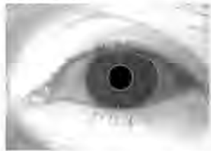
Area within orange concentric circles is extracted for template creation.

Iris recognition is unobtrusive. The individual does not need to be aware of the collection taking place for a successful collection to occur. High resolution cameras have improved to the point that photographs taken from up to 3 meters away from the subject will have the desired quality, with good focus that is required for iris recognition.