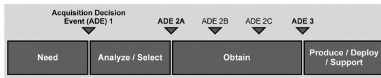
Figure 1: DHS Acquisition Life Cycle and Acquisition Decision Events

GAO-15-541T