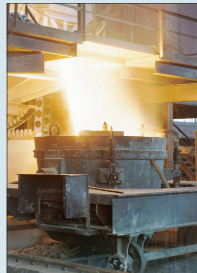
Alloy steels and superalloys made with molybdenum are very strong and corrosion resistant. Above, white-hot steel is being poured at the Allegheny Ludlum Steel Corp. in Brackenridge, Pa.

Approximately two-thirds of the molybdenum produced in 2008 was used in the production of alloy steels and superalloys. Stainless steels made with molybdenum have the strength and corrosion resistance needed for use in water distribution systems; food handling and chemical processing equipment; and home, hospital, and laboratory devices. Because of their strength and toughness, molybdenum alloy steels are used to make automotive parts, construction equipment, and gas transmission pipes. Molybdenum's important alloying properties have given it a significant role in modern industrial technology, which increasingly requires materials that are functional under high stress, expanded temperature ranges, and highly corrosive environments. Without molybdenum as an alloying metal, the superstrength steel used in heavy construction (such as in skyscrapers and bridges) would be more costly; in some instances, the increased weight of alternative materials with equivalent strengths would render construction unmanageable or even impossible. Other significant uses of molybdenum are as a refractory metal (a metal that is exceptionally resistant to heat) and in numerous chemical applications, including as catalysts, lubricants, and pigments.