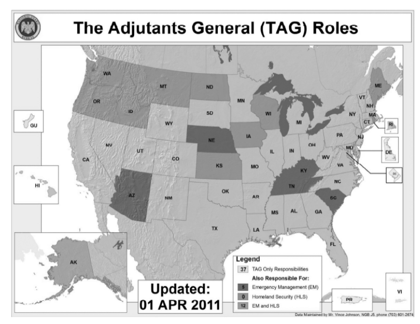
Exhibit 2, the Varied Emergency Management Roles of the Adjutant Generals

One of the oldest and most restrictive of the laws applicable to Defense Support to Civilian Authorities is the Posse Comitatus Act (PCA).<sup>14</sup> The PCA prohibits the use of Federal troops for law enforcement purposes, with some limited exceptions. But while the PCA restricts the use of Federal troops in law enforcement roles, such as traffic control points or patrolling in the aftermath of a disaster, National Guard troops serving in their State capacities are exempt from the restrictions of the PCA. The Federal versus State characteristics of the National Guard are discussed in greater detail below.