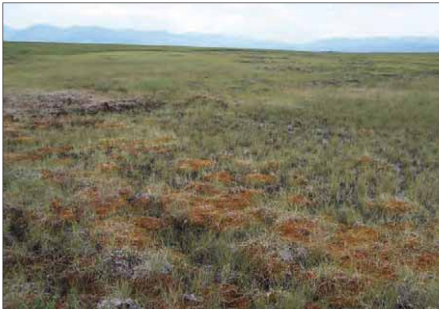
Figure 5. Study site 2004-11, a breached lake bed. Note the standing water even in this dry year.

This breached lake bed site was somewhat drier than the previous sites but still had extensive areas of saturated soil, capped with wet Sphagnum and Calliergon mosses as well as numerous clumps of tufted bul-