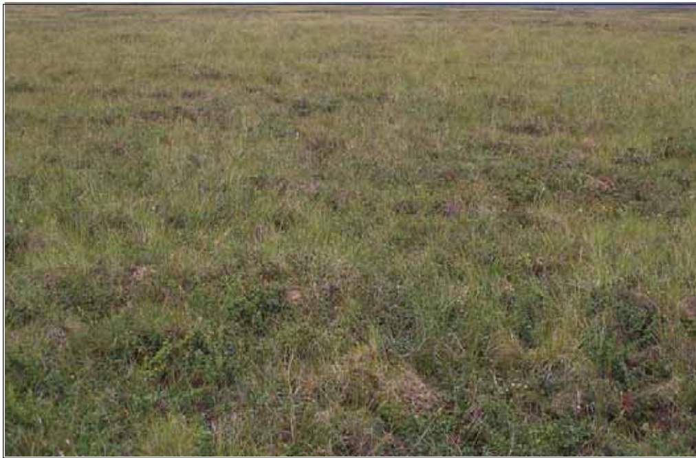
Figure 1. A typical Lichen Tussock Tundra ecological site in McCarthys Marsh. The average 35% sedge and grass biomass of this site, located immediately north of Study Site 2004-09, provides low forage quality.

Stephen DuBois is the Area Biologist for the region in which Alaska’s first bison introduction occurred. Bison management is