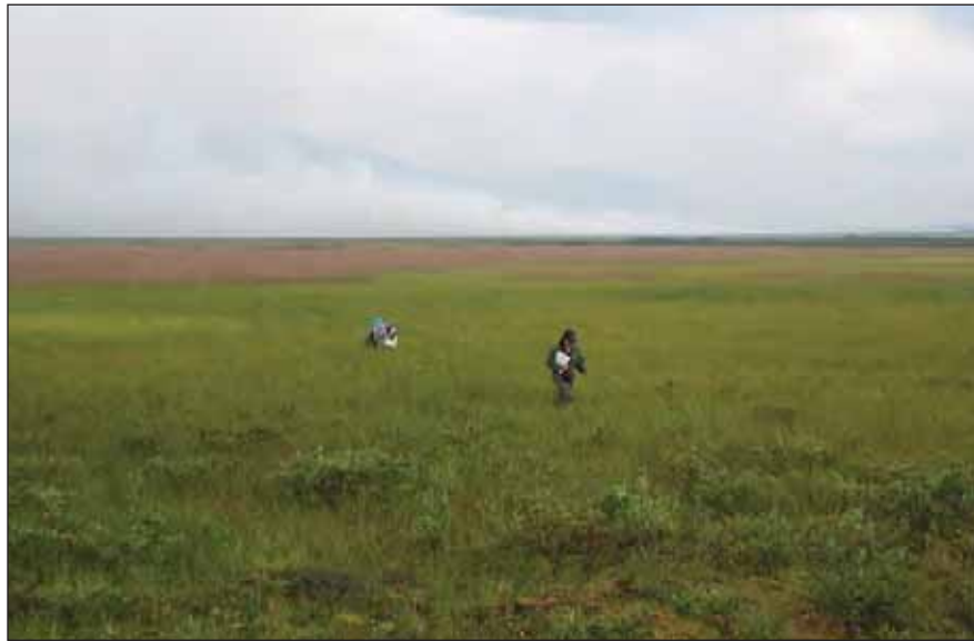
Figure 3. Study site 2004-08, a breached lake bed. A tundra fire burns actively in the background. The wet nature of this site probably prevented it from burning.

The moist-to-wet substrate at this site would not provide suitable access terrain for bison use during summer and fall, even though the wetland sedges and bluejoint grass species present could support limited grazing ( Figure 3 ).