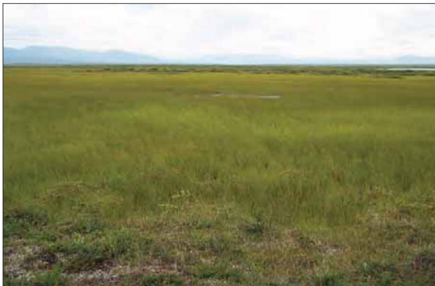
Figure 4. Study site 2004-09, a breached lake bed. Note the standing water even in this dry year.