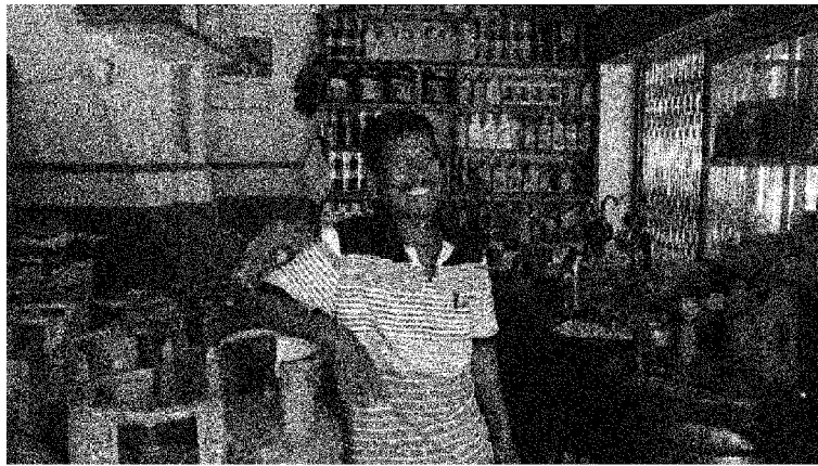
A successful auto-garage store owner in Indonesia who benefitted from the Development Credit Authority loans.

One of the most dependable areas of bipartisan consensus has always been the United States government's support for global development. And now it seems the Trump administration has found agreement with some members of Congress on at least one critical part of the global development agenda: Supporting U.S. commercial engagement in emerging markets.