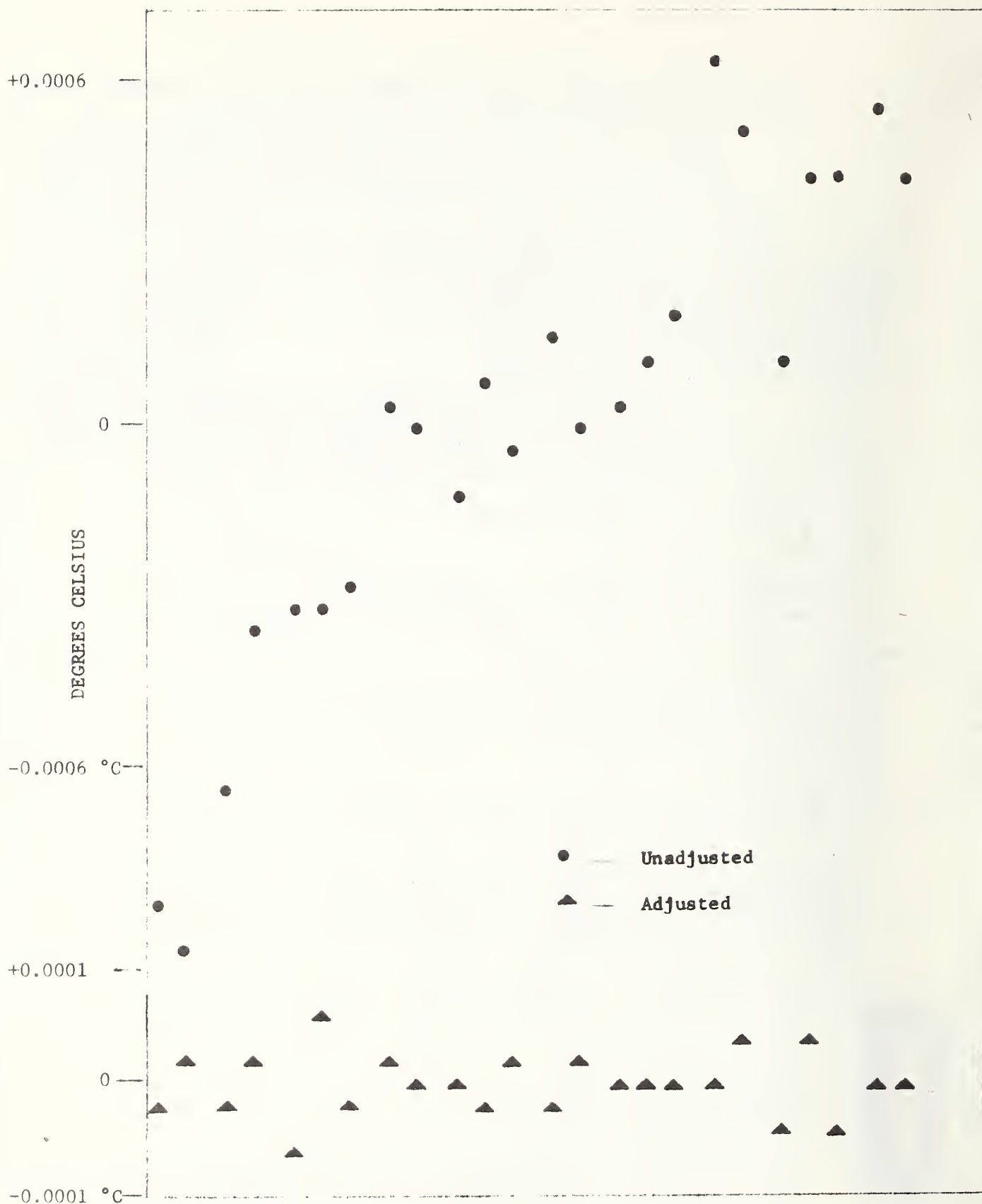
FIGURE 2: Plot of residuals illustrating behavior of bath at 15 °C during 50 minute interval required for the 24 observation series.

Data shown before and after adjustment for trend.